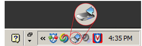
Right-click on the Replica icon for menu

To use your Replica with a different computer, follow the Quick Start Instructions on that computer.