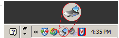
Replica Icon in the Desktop Tool Tray (highlighted)

If Replica is disconnected, the date and time displayed reflect the last time a backup operation was performed.